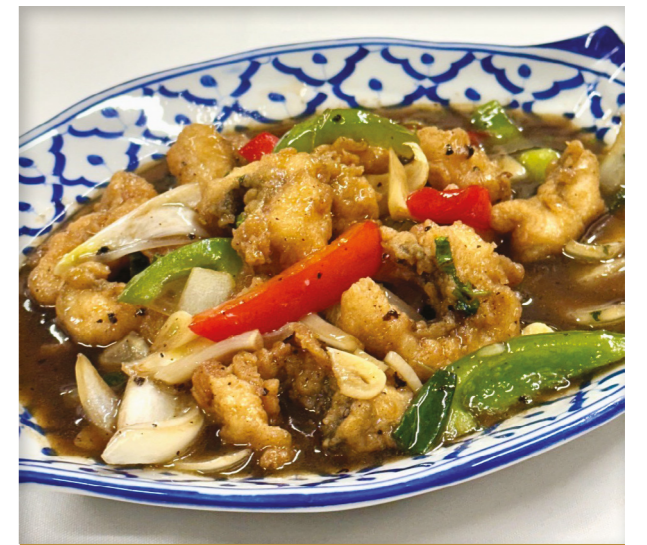
Crispy Sea Bass Black Pepper Sauce