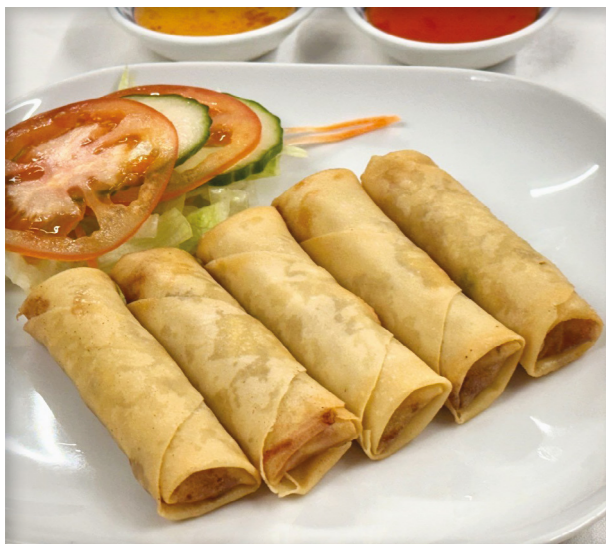
Thailand Spring Rolls