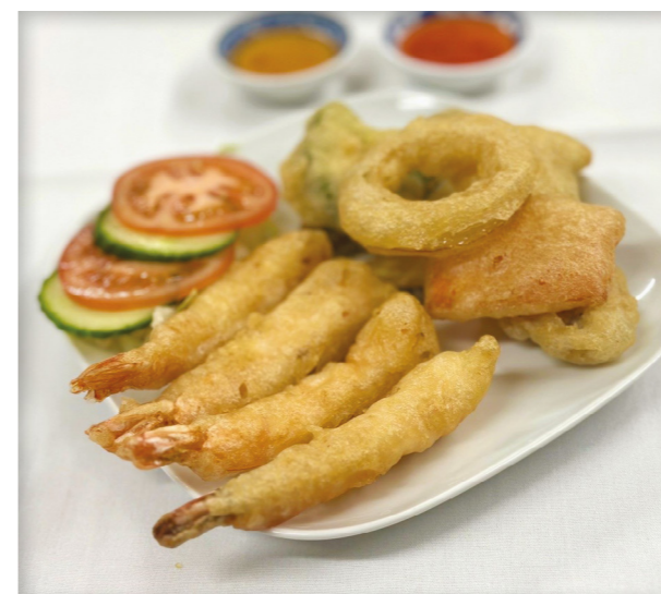
Goong Chup Pang Tod