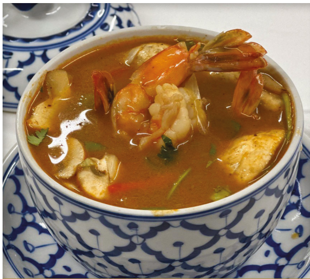
Tom Yum Goong